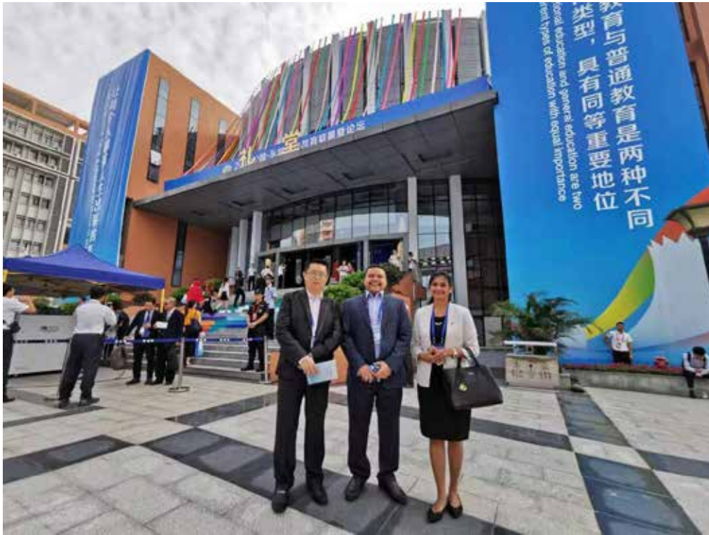
Representing MIU at Lushan College of Guangxi University of Science and Technology