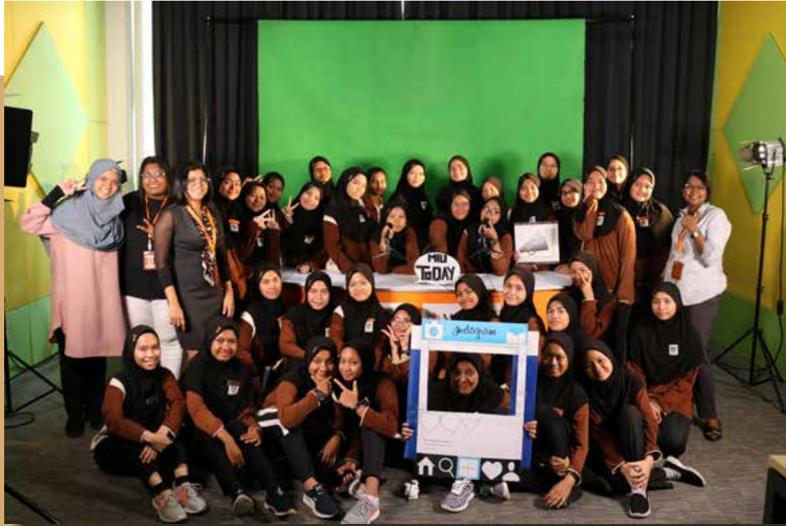
VISIT FROM SEK. TINGGI PEREMPUAN MELAKA