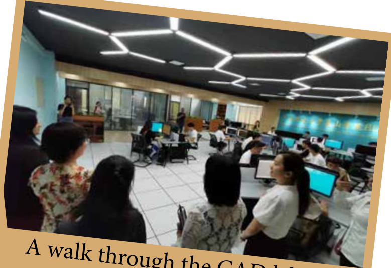
A walk through the CAD lab