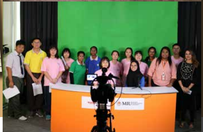
VISIT FROM SMK BAHAU 2